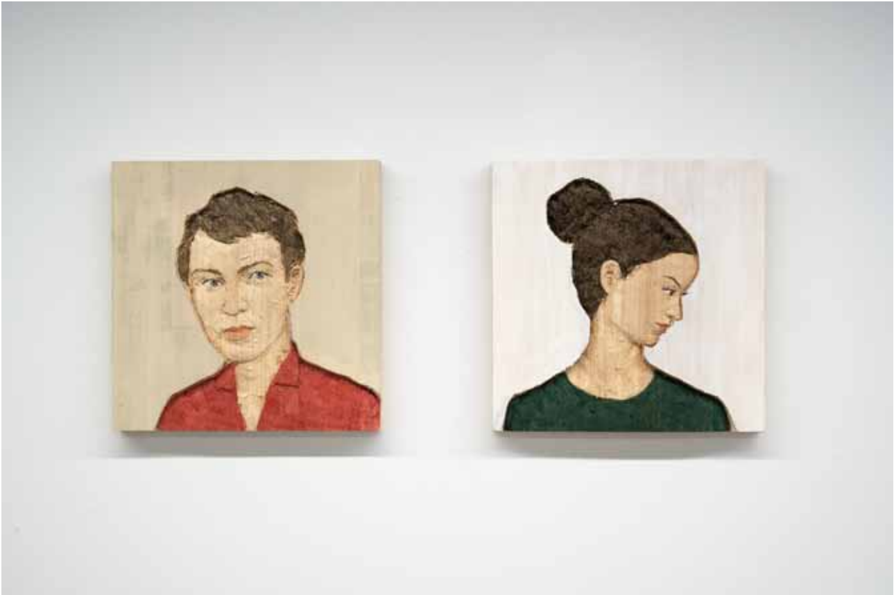
Kleines Relief Mann (rotes Hemd), 2021 populier en verf / poplar and paint 36 x 36 x 4 cm SB208-03321-004