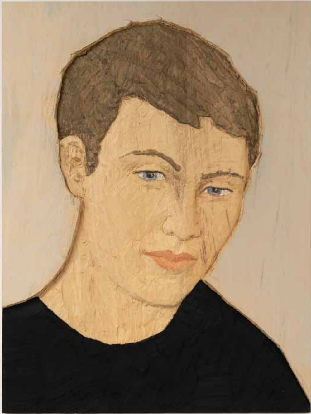
Relief Mann mit schwarzem Hemd, 2021 wawa hout en verf / wawa wood and paint 60 x 80 x 3 cm SB2021-001