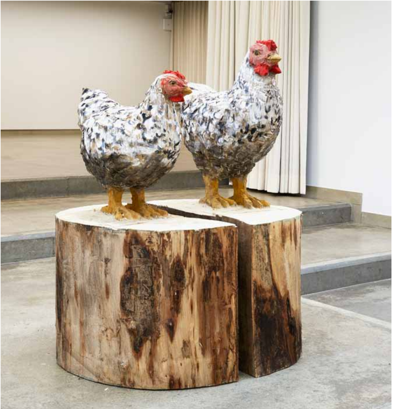
Hahn & Henne, 2021 populier en verf / poplar and paint tot. 112h x 70d cm; beide kippen / both chicken 40 cm breed / wide SB208-03321-006