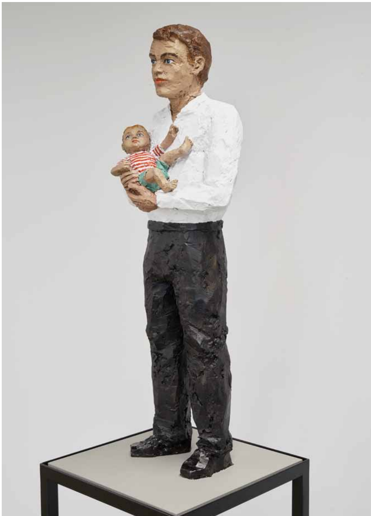
Mann mit Kind, 2021 gepatineerd beschilderd brons / patinated painted bronze 64 x 27 x 27 cm; plaat / plate 27 x 27 x 0,8 cm ed. 30 + VI A.P. SB207-03221