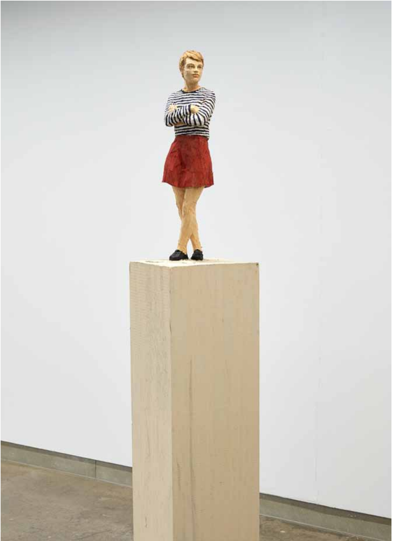
Frau mit rotem Rock, 2021 wawa hout en verf / wawa wood and paint fig. 63h cm / tot. 169,5h cm SB208-03321-001