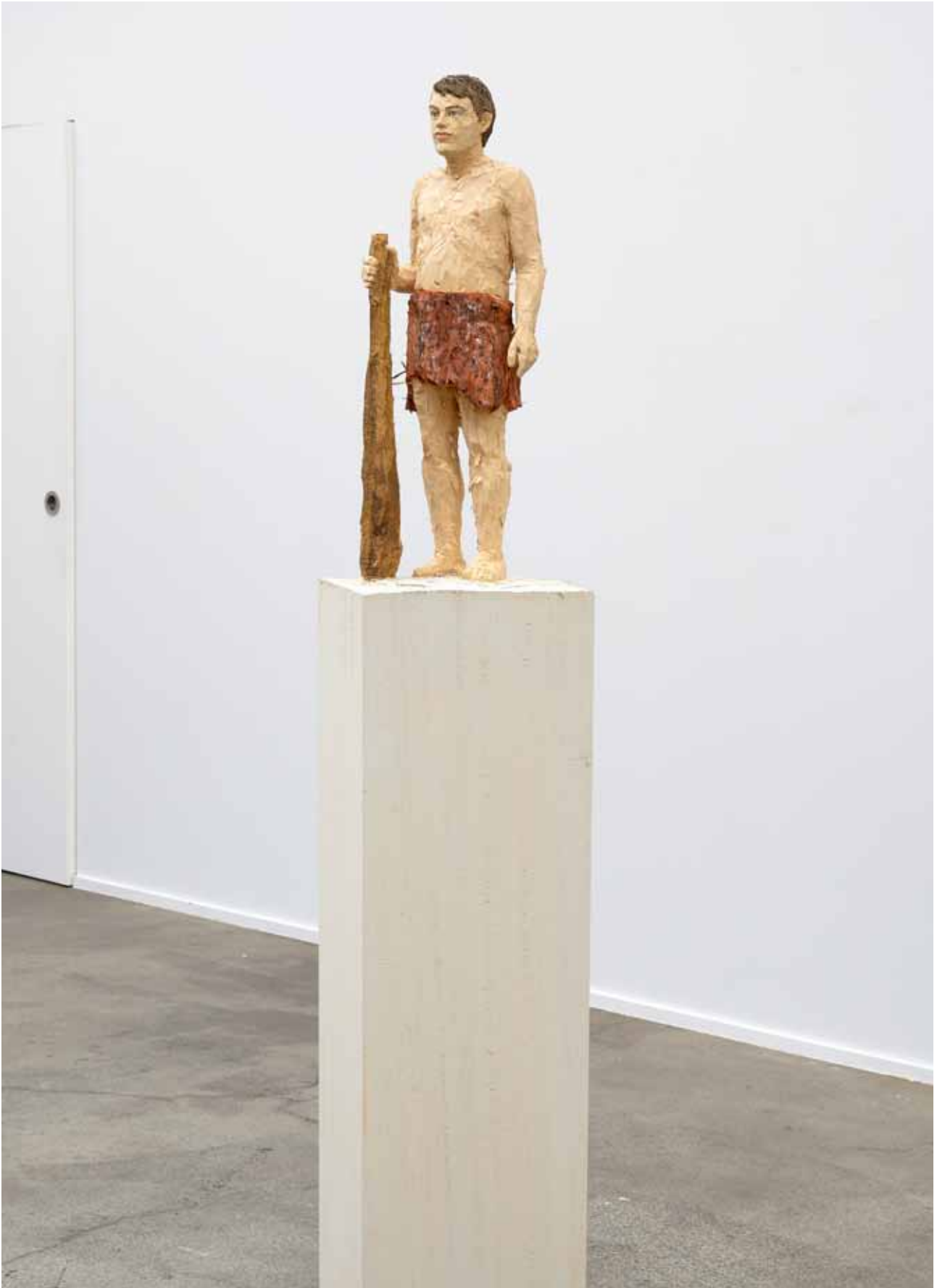
Herkules, 2021 wawa hout en verf / wawa wood and paint fig. 65h cm / tot. 171,5h cm SB208-03321-002