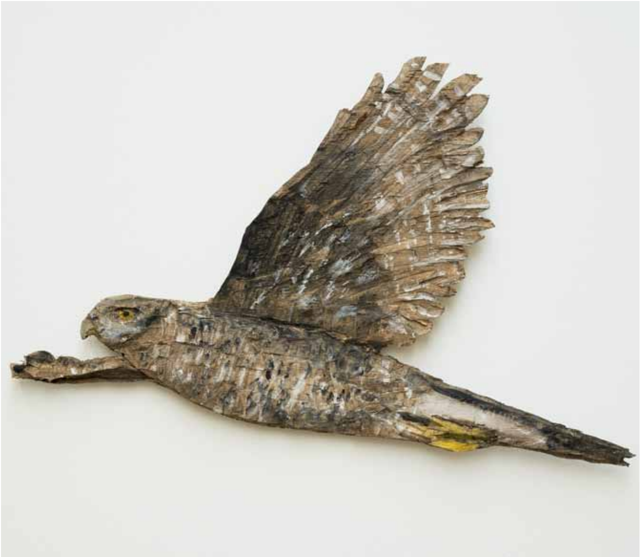
Adler, 2021 wawa hout en verf / wawa wood and paint 44 x 2,5 cm SB208-03321-005