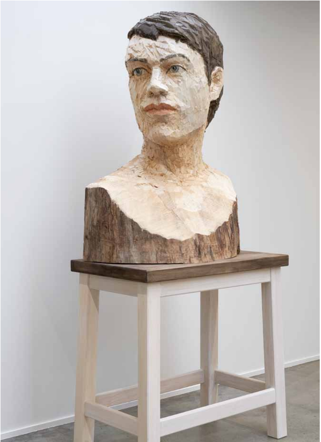
Grosser Kopf, 2021 populier en verf / poplar and paint fig. 127 x 93 x 53 cm / tot. 227h cm SB208-03321-007