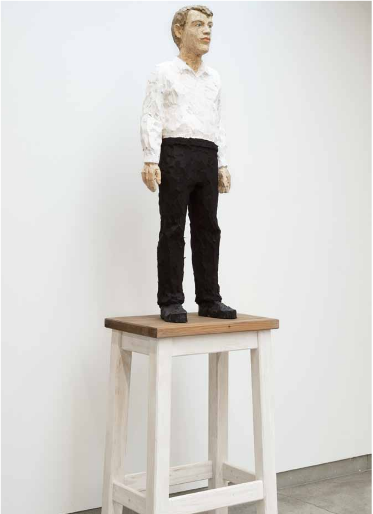
Figur schwarz/weiss, 2021 populier en verf / poplar and paint fig. 128 x 43 x 21 cm / tot. h. 228 cm SB208-03321-008